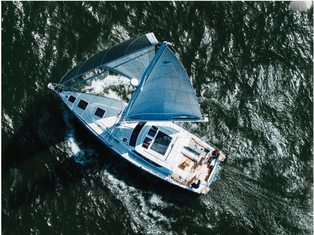
The Tartan 455 hauling the mail on a breezy sea trial on Lake Erie.